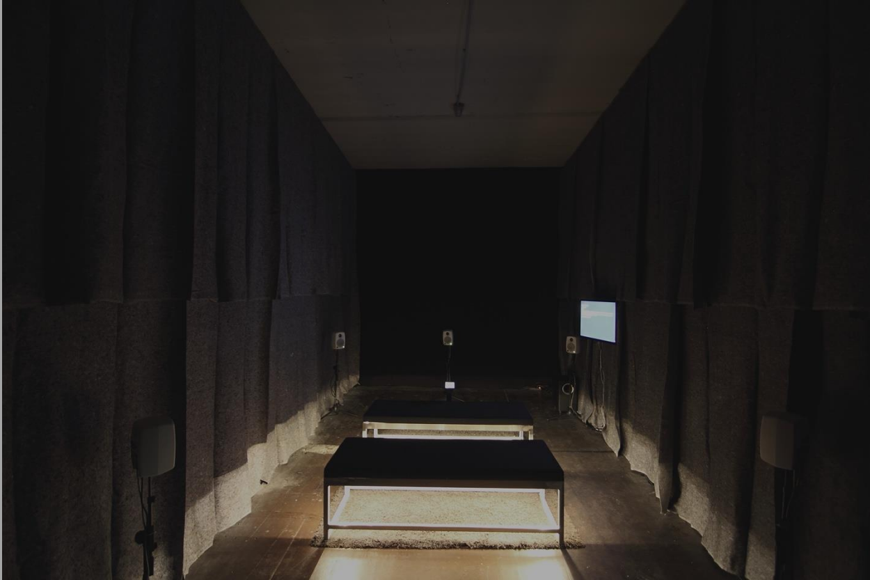
The listening space with 5.1 surround sound, a small touch screen to select the contribution of one of the artists and a bigger screen for information on that piece.