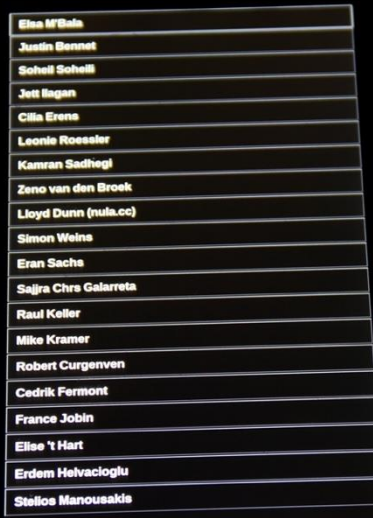
Touch screen with 20 western and non-western sound artists